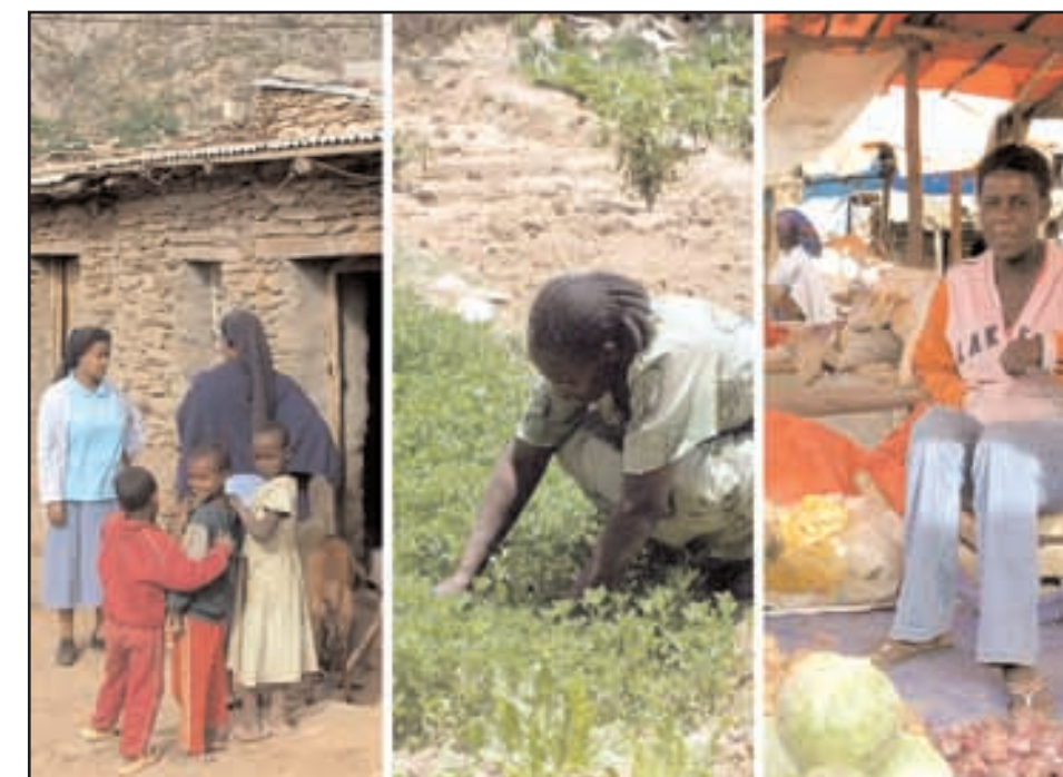
Through Cross Catholic, women who once felt trapped and isolated by their circumstances now have access to new opportunities that give them hope and greater self sufficiency.